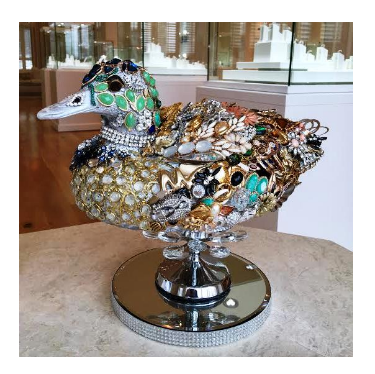
This duck is by our own Michelle Eroche in 2018